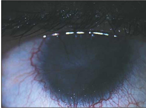
Figure 1. Phthisis bulbi in the left eye after corneal perforation due to microkeratome misassembly.