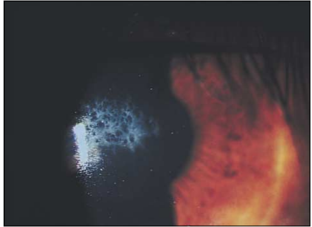
Figure 2. Haze after photorefractive keratectomy retreatment of the undercorrection of the right eye.